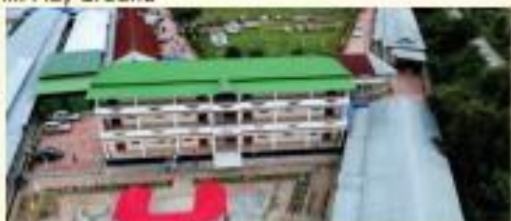
v. Class Room (South Block)