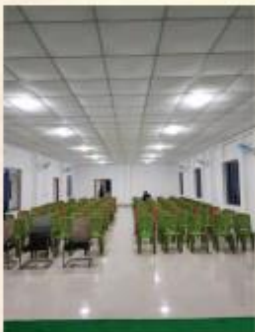
iv. Nongin Seminar Hall