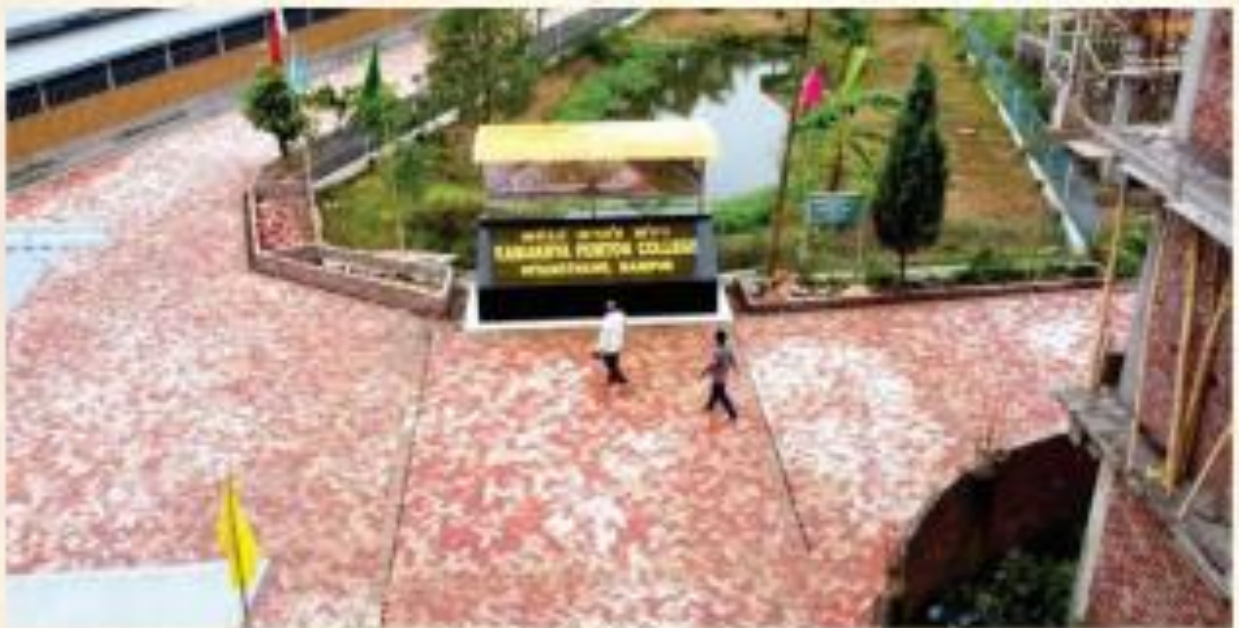
xii. Main Entrance