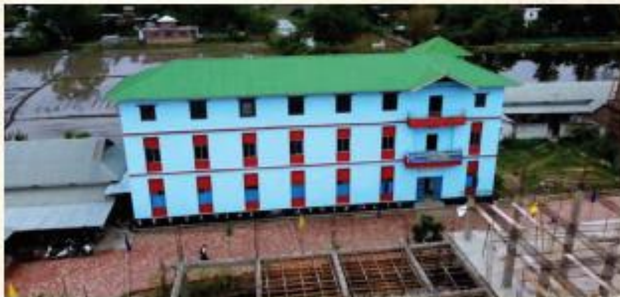
viii. Fitness Centre