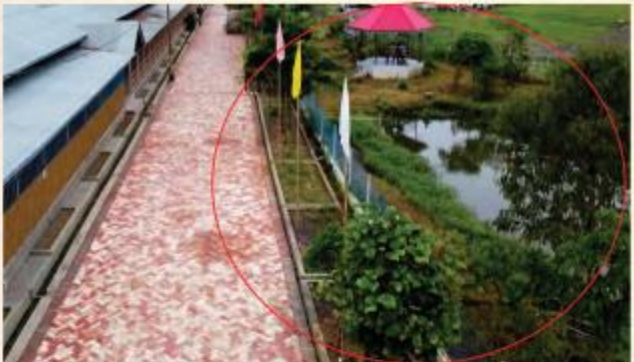
xii. Botanical Garden