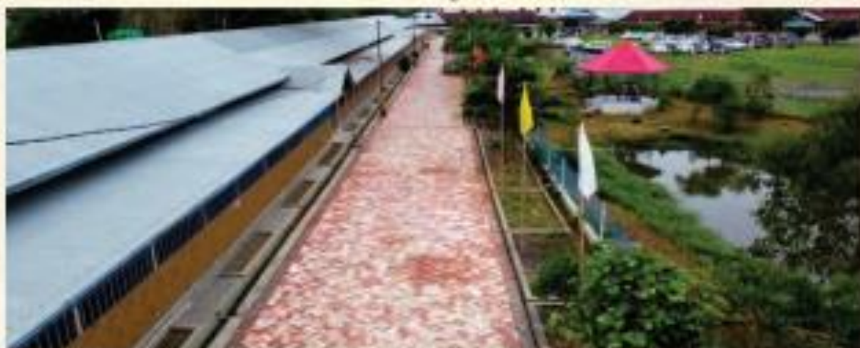
x. Well Maintained Campus