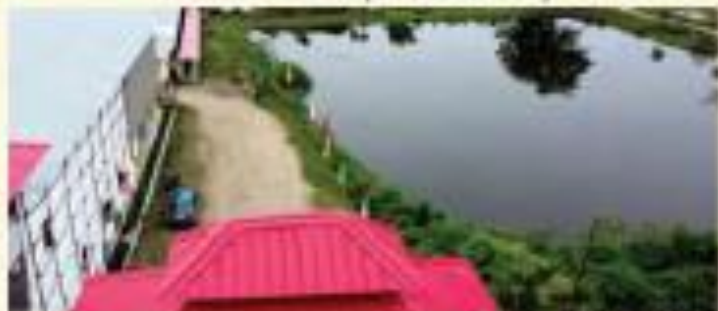
vi. Water Reservoir