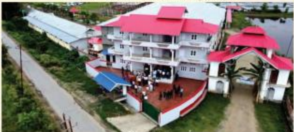
ii. Guest House