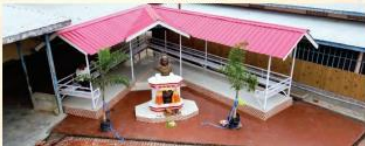
ix. Waiting Shed