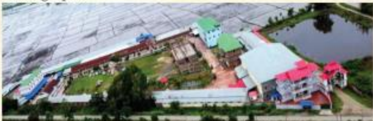
I. Aerial view of Kamakhya Pemton College Campus