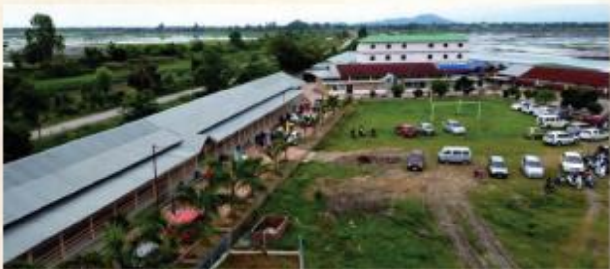
iii. Play Ground