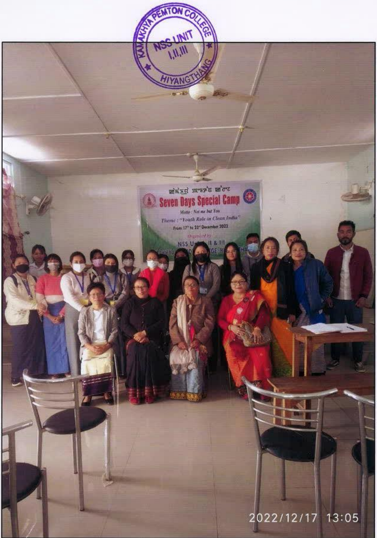
2. Photograph taken during Inaugural Function of the camping programme.