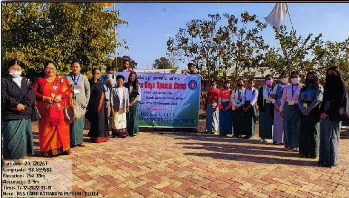
1. Photograph taken during Inaugural Function of the camping programme