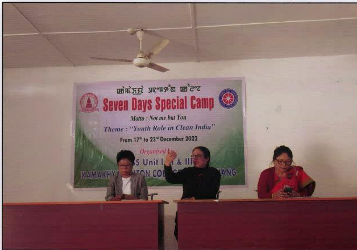
Photo – Session