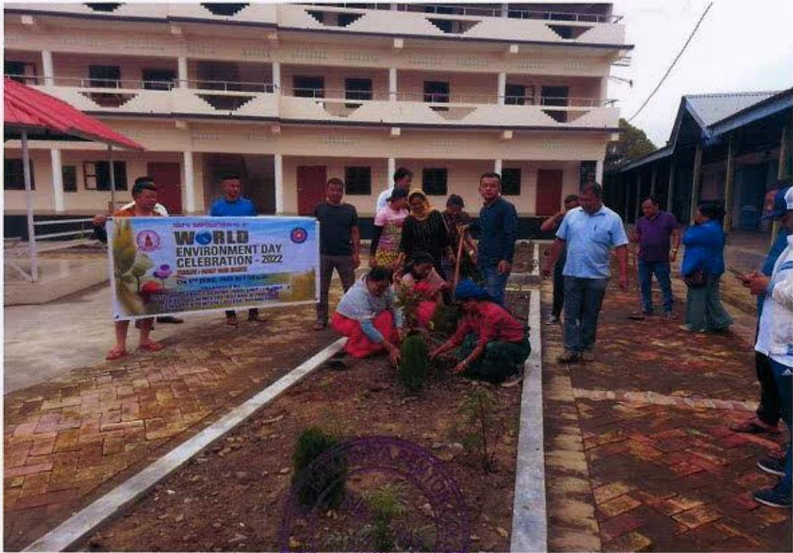
WORLD ENVIRONMENT DAY (5 TH JUNE 2022)