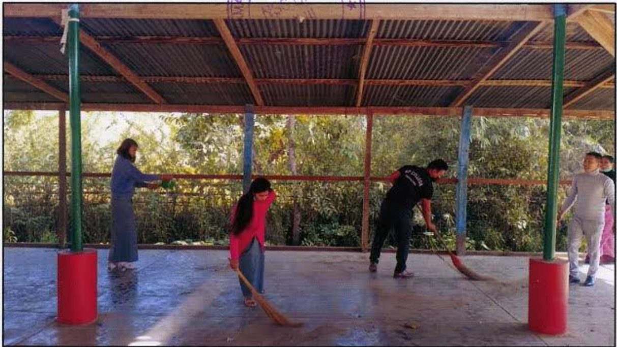
3. Social work at adopted village "Hiyangthang Kabui Khul".